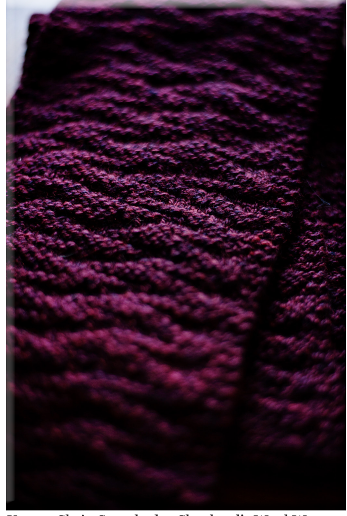
Yarn: 1 Skein Stonehedge Shepherd's Wool Worsted, 250 yards, 100% Merino Wool, color Berries

Please read the entire pattern before beginning.